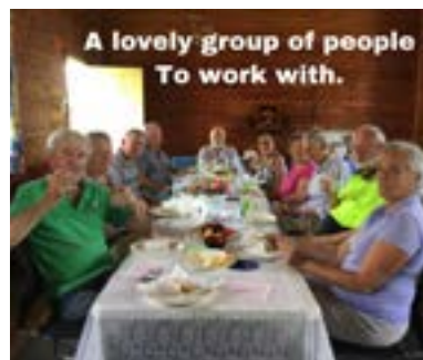
BUNDARA WORK TEAM

For those wondering, the Wyee MMM base remains accessible to MMMers. A local Pastor and his family are renting the property until we can find our new Region Managers. The office and the self-contained unit are for the exclusive use of MMM as are the caravan spots and associated sheds. God bless MMM NSW.