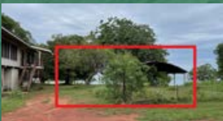
From the CEO's Desk pg 3