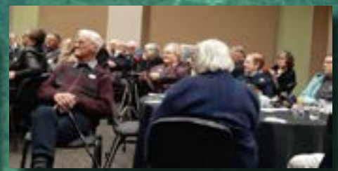
Prayer News Update pg 8