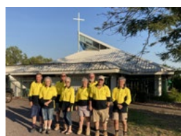
ST JAMES ANGLICAN CHURCH

At the same time as the Build-a-Bond team landed in Darwin the Top End Safari Team were also arriving at the site of their first project in Sanderson, Darwin. St. James Anglican church set on a generous piece of land warmly welcomed the Safari team and provided plenty of space for them