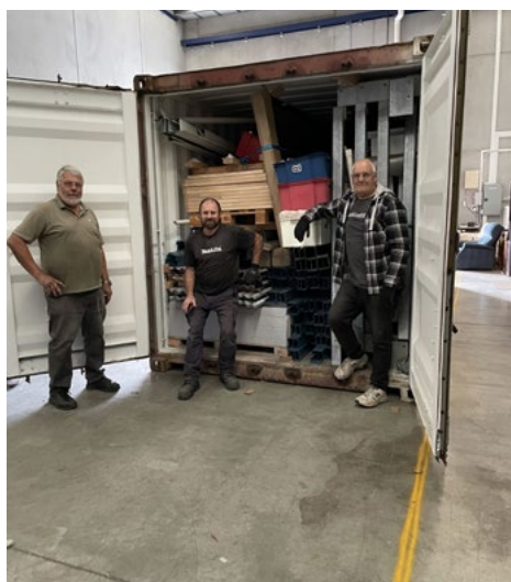
12 TONS PACKED READY TO GO

The Build-a-Bond team arrived in Darwin in mid May readying themselves for the intense weeks ahead. Some flew in to Darwin or Maningrida but most made the long trip by road. To get to this point was a great milestone given the amount of work required to make this project feasible. Months of design, documentation, planning and hard work had already been completed. The process was marked by the many answered prayers along the way.