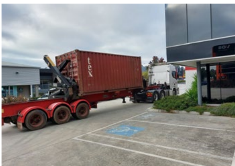
ON ITS WAY TO DARWIN PORT VIA RAIL

linguistically diverse community in the world with at least 12 vital languages. The translation centre is to be a community based operation.