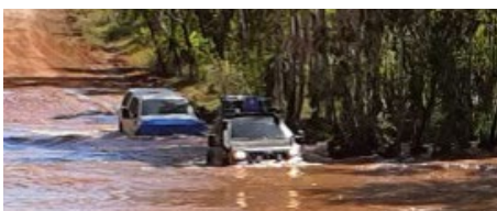
WE GO EVERYWHERE

Like the Build-a-Bond team swollen rivers needed to be negotiated.