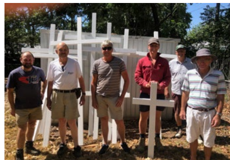
CROSS MAKING IN JABARU WAITING FOR THE RIVERS TO GO DOWN

Preparations continued, tickets were booked and many made the long drive in faith with the first confirmation of the slab being down and ready to build upon coming on the day the team had hoped to arrive on site. Logistics