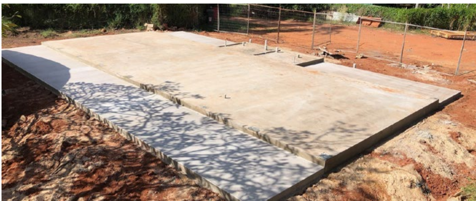
PRAISE GOD THERE IS A SLAB!

To get this project out of the ground was one of the many hurdles to cross. The concrete floor slab had to be the work of a local builder but communication was difficult and so it was unknown whether the slab would be ready in time for the teams arrival.