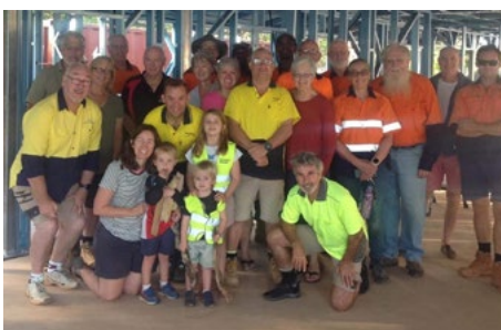
TWO TEAMS COMBINE

This meant the team had to travel lightly leaving road caravans behind and for some, leaving comfortable beds behind too. For the first week of the two teams working together