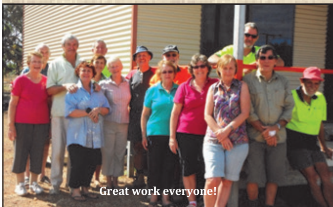
Great work everyone!