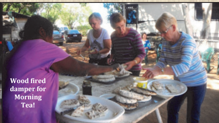
Wood fired damper for Morning Tea!