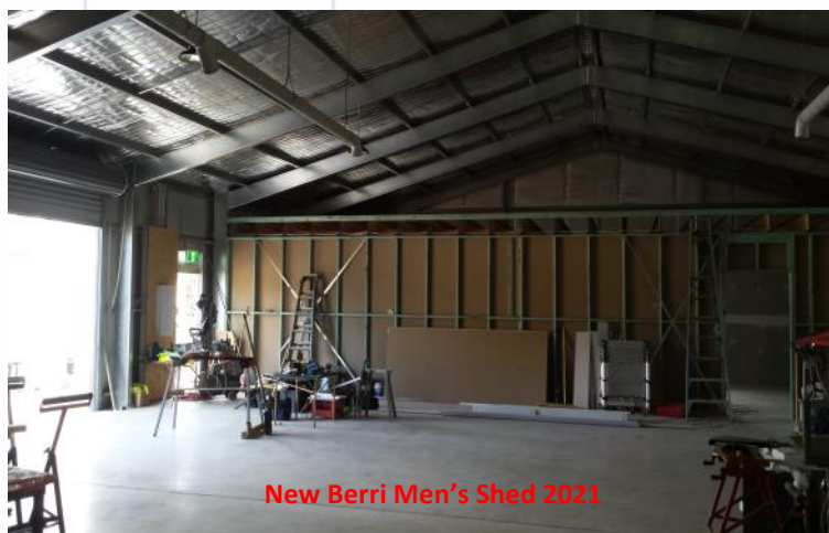
New Berri Men's Shed 2021