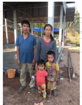
The persecuted family

We are blessed to be able to serve others through the prayers and ongoing financial support from MMM in Australia. Thank You to everyone who supports us in Thailand through MMM Australia!