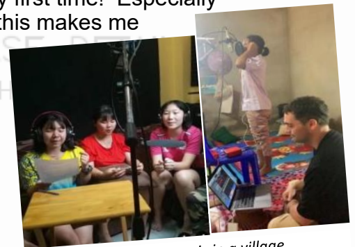
Recording music in a village

original plan to redeem cultures and tribes helping them to know the creator of the universe.