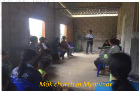
Mok church in Myanmar

This past month, Pedro continued helping M28 studio; a ministry working with minorities tribes in Asia. They create music and media allowing them to worship God in their own languages. M28 is located in Thailand and asked Pedro to build a portable recording studio because sometimes villagers are not allowed to cross the border into Thailand. Building the studio this way, they can carry their equipment with them to remote villages. They can record music or spoken scripture from the Bible in tribal languages so that people groups can have music in their own language to worship God. This project is for the Mok tribe in Myanmar. Here are some pictures to show how God is moving and changing lives during the persecution from the government in Myanmar. Imagine the comfort to be able to sing and worship God in their own language and to listen to the Bible in