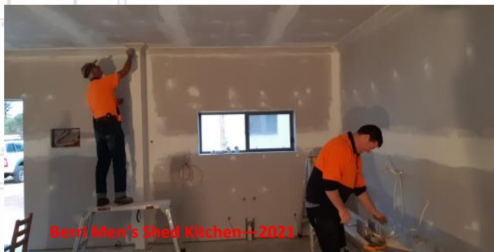
Berri Men's Shed Kitchen—2021

And Thank You to both couples, for giving their time and ability, to attend such a wonderful project.