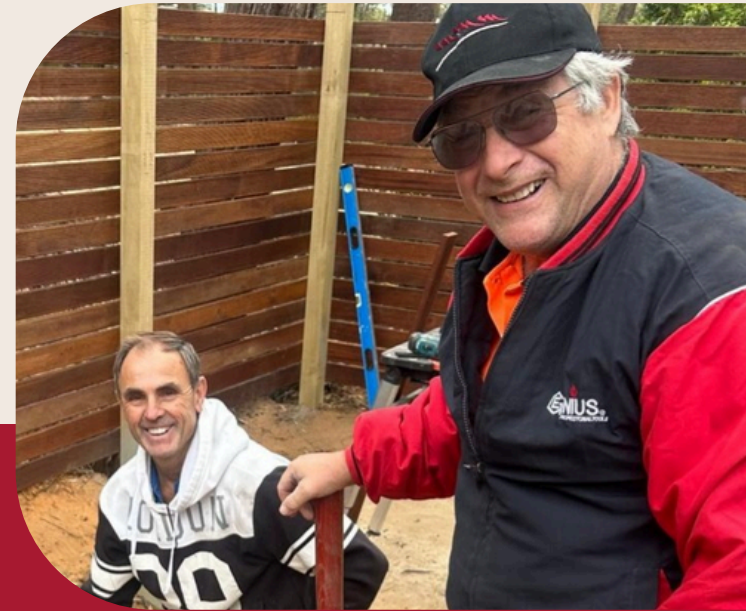
Katoomba Christian Convention project