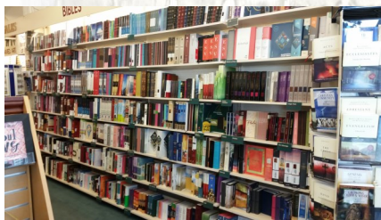
Bibles for Launceston

family with drug issues, as well as Bibles and prayer. Even the Worldview Centre for Intercultural Studies (WEC) has benefited with new shelving for their library for students as they prepare to go out on the mission field across the world. What a privilege to be a small part of all of this as we continue to ‘serve those who serve’.