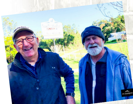
Terrigal Presbyterian Team