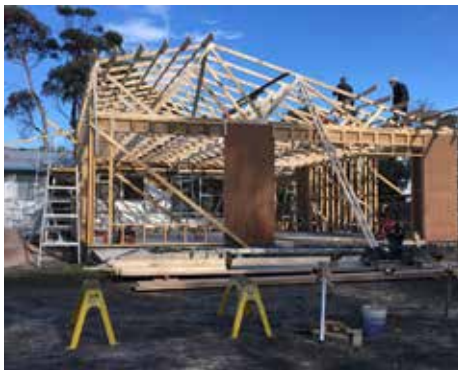
CAMP CLAYTON FRAME

In December 2021 the team completed both projects, a milestone in itself, to ensure the ongoing viability of one of Tasmania's most successful Christian camp-sites. Over all between the two projects, our teams contributed around 315 hours of effort. No doubt we will be back there in the near future on another