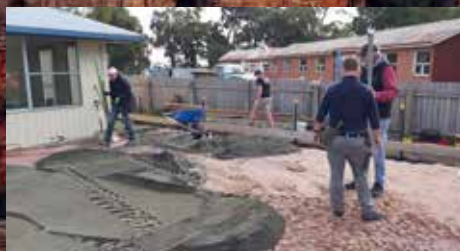
Camp Clayton Milestone pg 4