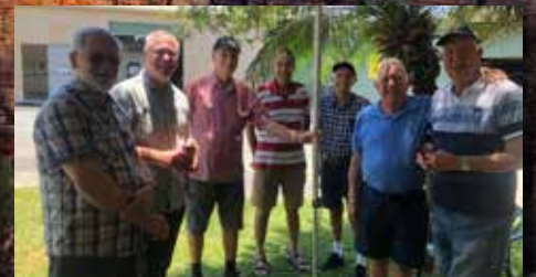
QLD Christmas Lunch pg 6