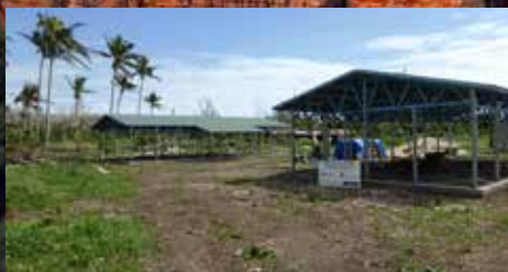
From the CEO' Desk pg 3