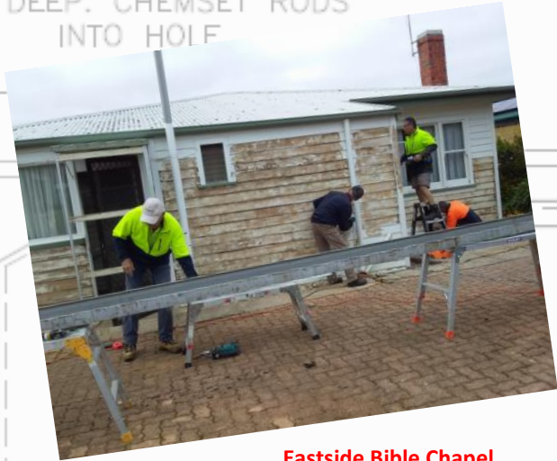
Eastside Bible Chapel