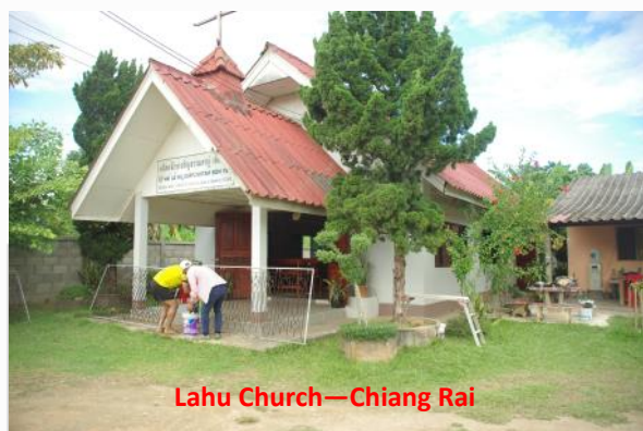
Lahu Church—Chiang Rai