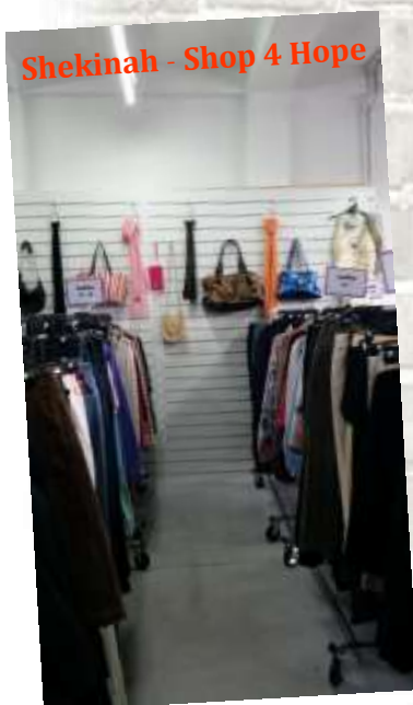
Shekinah - Shop 4 Hope