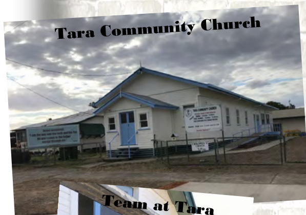
Tara Community Church

For the last TeamNews for 2019, here are a few photos of places we've been and some of the people who have helped to get the projects done. Thank you for praying for us through the year, helping with events, activities and projects and for your financial support. We hope you enjoy a blessed Christmas season with friends and family.