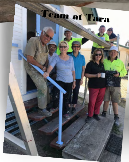
Team at Tara