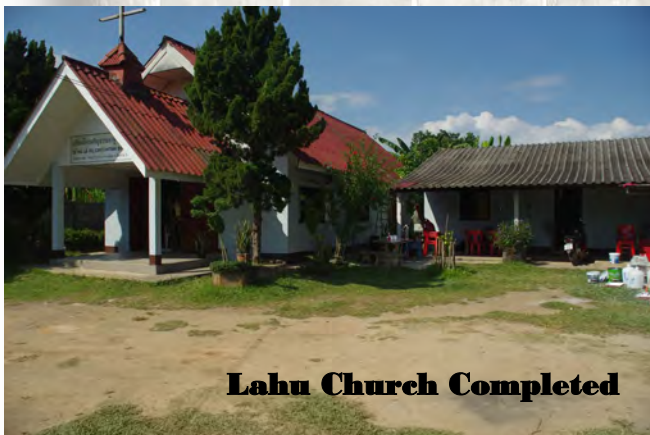
Lahu Church Completed