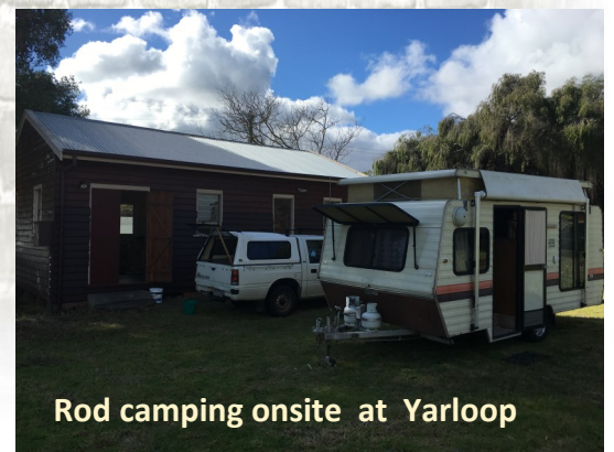
Rod camping onsite at Yarloop

MMM Western Australia - Trevor & Karen Beard. 33 Furley Rd, Southern River, Western Australia, 6110 Phone: 08 9456 0022; Mobile 0409 778 799; Fax 08 9456 0022; Email: mmmwa@mmm.org.au