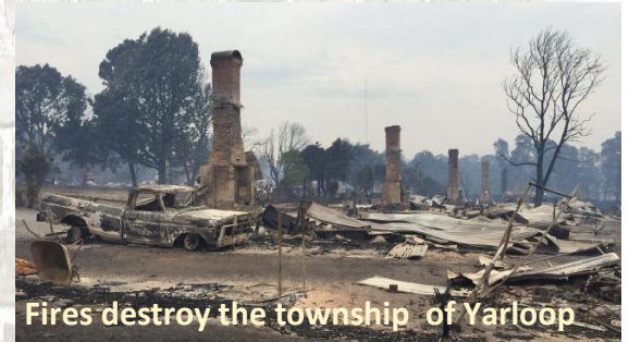
Fires destroy the township of Yarloop