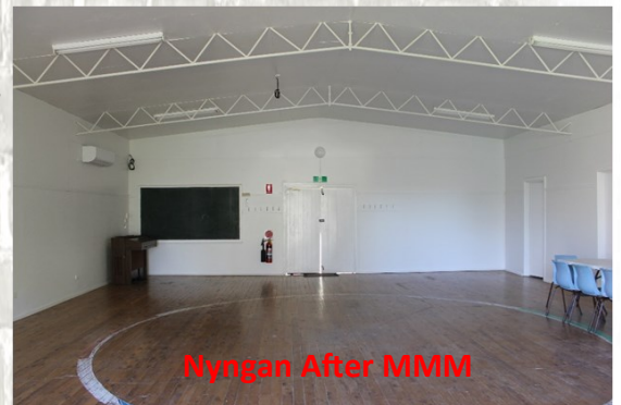
Nyngan After MMM

The church commissioned an electrician to remove and reinstall the lights, plus new GPOs ( all time and materials donated ) and an air-con man to install two split system air conditioners ( 1 donated by the manufacturer ) both of these contractors had to come out from Dubbo. There were so many blessings on this project, donated air conditioners, stove, and BBQ as well as volunteer licenced tradies all to complement the MMM team.