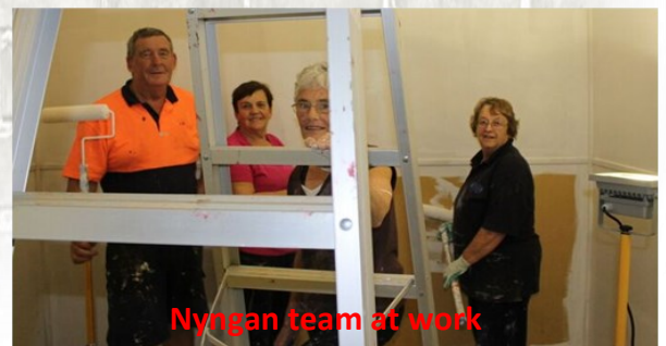
Nyngan team at work