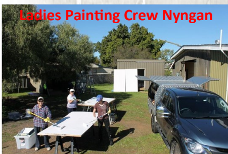
Ladies Painting Crew Nyngan

The small congregation farewelled us on the final night with a Chinese meal and informed us that the new youth group will be starting next Friday night! You could sense the overwhelming feeling of excitement in the air with thanks to the Lord and the MMM Team.