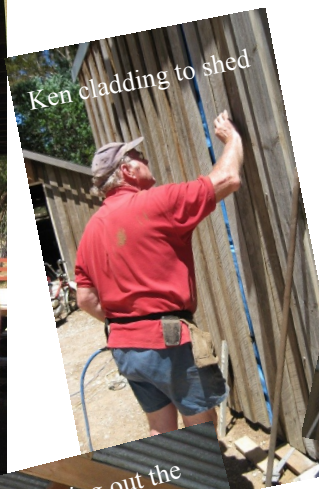
Ken cladding to shed