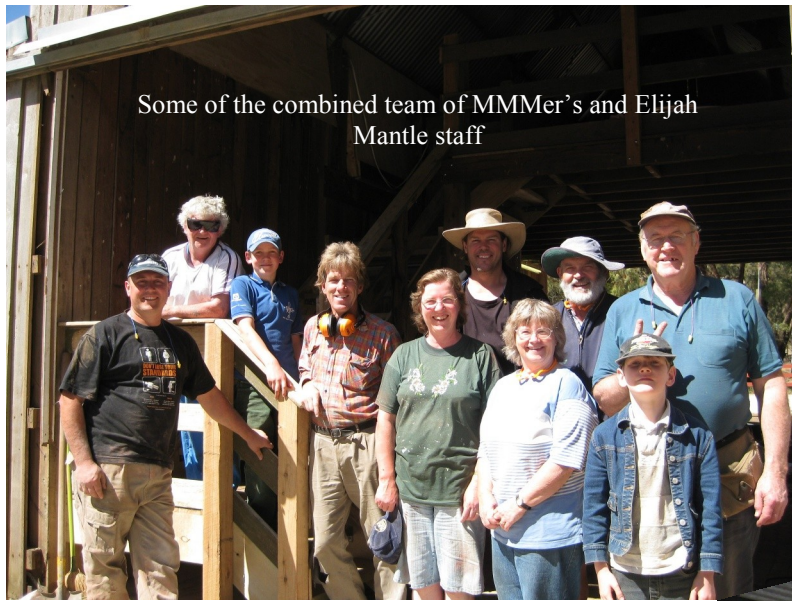
Some of the combined team of MMMer's and Elijah Mantle staff