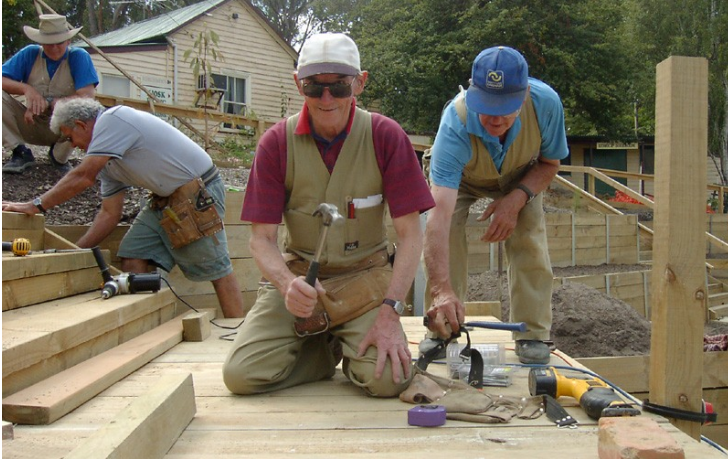
MMM volunteers assisting Belgrave Heights Convention Centre in 2001 ... Will this be you in 2014?

Belgrave Heights Convention Centre. The total renovation of the bathroom facilities in 'The Lodge' accommodation at Belgrave Convention Centre has been requested of MMM. The project will start on November 3 and the project will end when the work is done. We have until mid Dec, to complete the work.