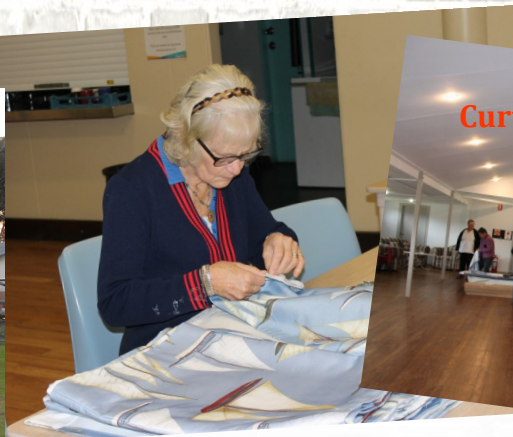
Curtain Making at Foster