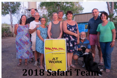
2018 Safari Team

Well we are finally here in sunny/hot Northern Territory ( I know many of you would love to be somewhere where it is warm ). Some of our team are new to MMM work so it's been great getting to know them. Our team comes from Busselton in W.A., Gladstone, Cashmere & Tamborine Mt, all in QLD and the Central Coast NSW. For this particular job we have only had 5 couples but we are looking forward to being joined by our 6 th couple when we are back in Darwin.