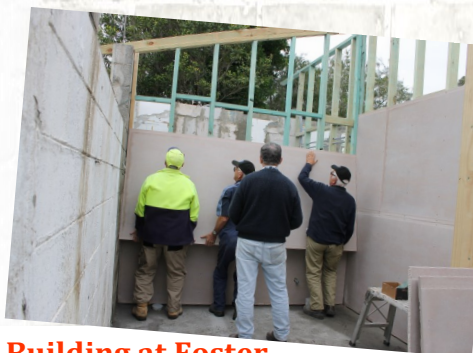
Building at Foster