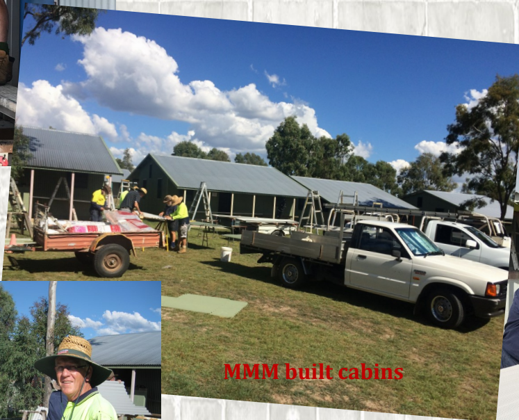
MMM built cabins